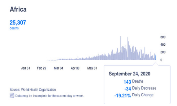
Figure 2: Number of COVID-19 deaths reported weekly by Africa as of 24 September 2020 (Adapted from WHO COVID-19 Situation report).

Africa has seen a 2% decrease in newly confirmed cases and a 17% decrease in deaths. South Africa consistently reports the largest number of cases